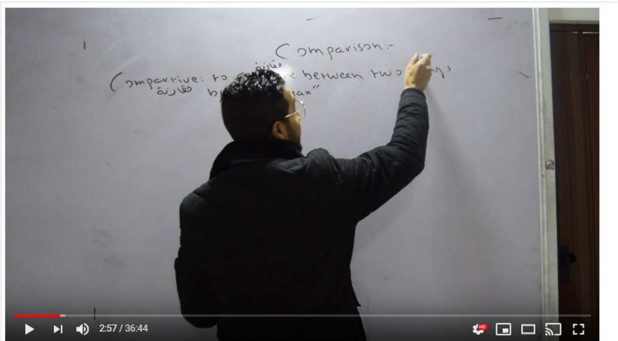
الدرس الأول، الوحدة السادسة Comparison : comparative and superlative