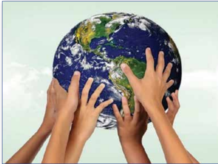
Hand by hand to save environment